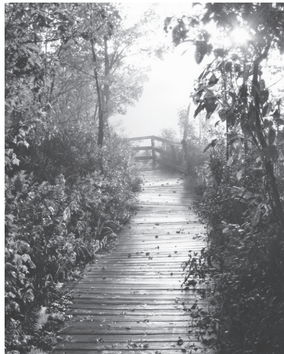
"Fall Morning on the Lake Loop" Gerard Beckhusen