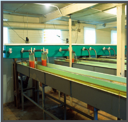
Inside the hatchery

We get our eggs from an outside source and hatch them right here in the Tall Hatching Jars. We raise them from September to May and then they are moved to the outside ponds. The trout remain in the ponds until they are 1 and 2 years old. Volunteers are then used to help stock the fish in all of